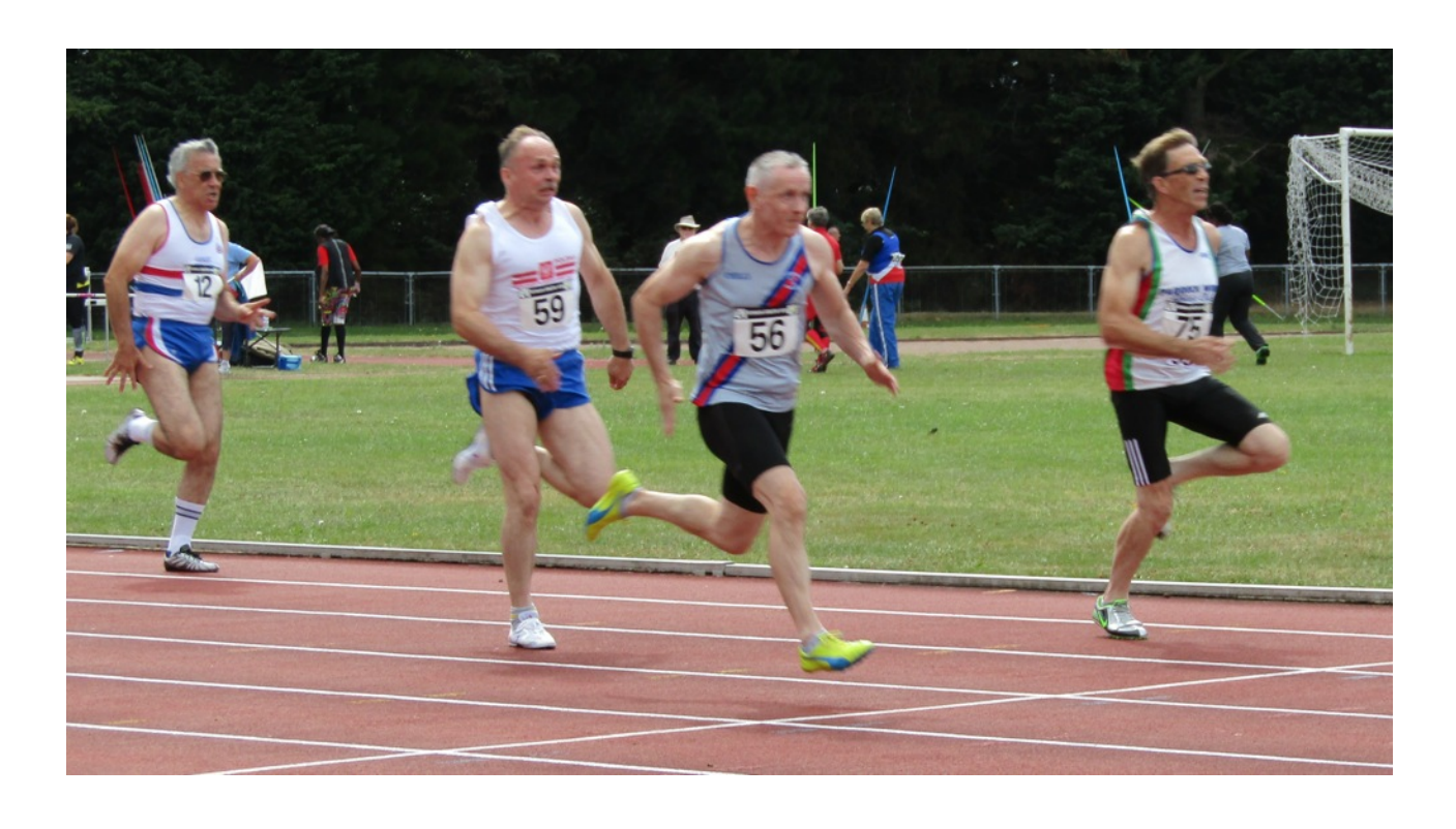
Men's M55 100m

Liz Sissons won all four throws in the W70 group, shot 8.28, discus 19.52, hammer 21.16 and javelin 20.12. Pam Jones, now in the W80 group set two new CBPs, 4:23.37 for 800m. and 8:59.52 for 1500m.